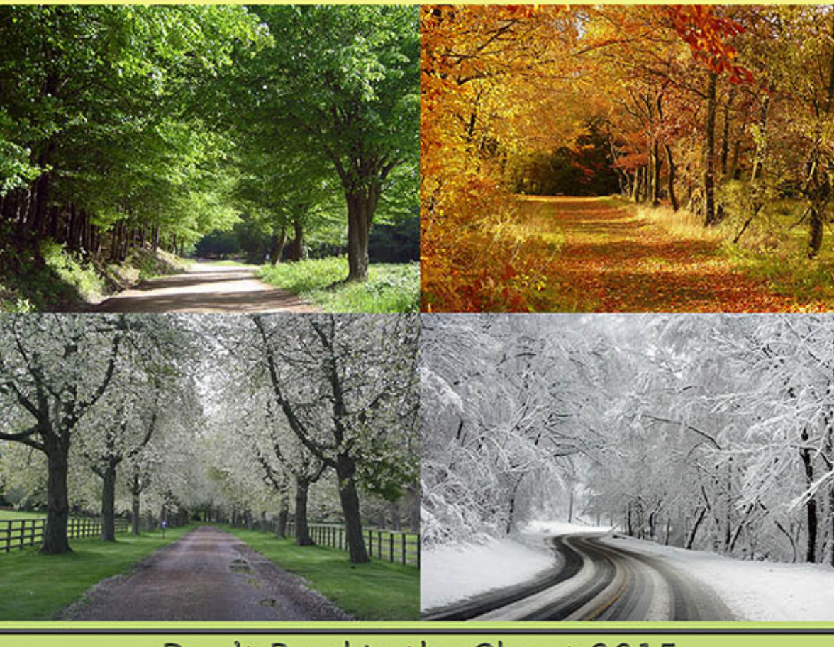
Don't Read in the Closet 2015